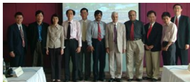
Participants in IAEA/RCA Meeting of network of Asian cardiologists in radiation protection

There were two sessions on radiation protection in AICT 2008. One session involved a one-hour lecture given by myself and another session included a 2-hour panel discussion. Thus, there was an excellent integration of the activities of the network with the regional conference, which had about 800 participants.